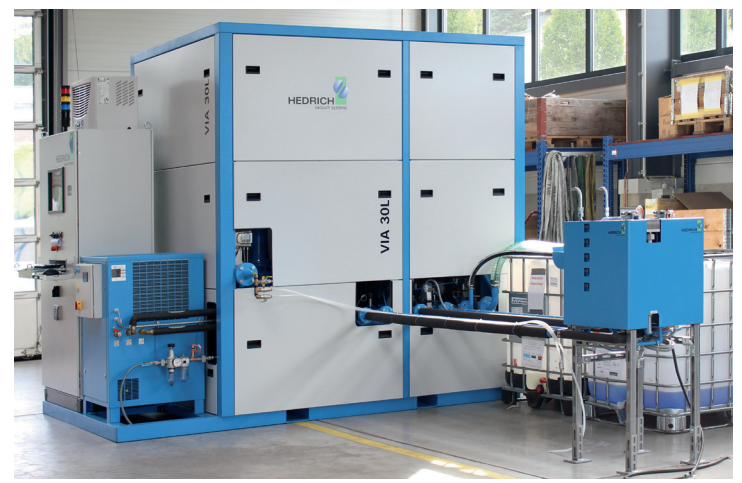
HEDRICH Vacuum Infusion Equipment VIA 30

In the first process step, this equipment prepares the two constituents resin and hardener separately from one another. During this preparation, gas and moisture dissolved in the constituents are removed to obtain optimally prepared constituents for the casting process.