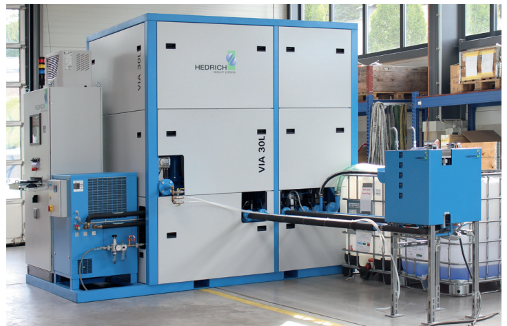
HEDRICH Vacuum Infusion Equipment VIA 30

In the first process step, this equipment prepares the two constituents resin and hardener separately from one another. During this preparation, gas and moisture dissolved in the constituents are removed to obtain optimally prepared constituents for the casting process.